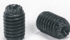
HIGH TENSILE GRUB SCREW