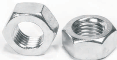
S.S HEX NUT