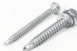
S.S SELF - DRILLING SCREW