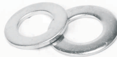
S.S PL. WASHER / PUNCHED WASHER