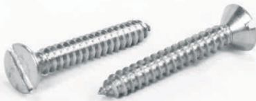
S.S SLOTTED CSK HD. SELF-TAPPING SCREW