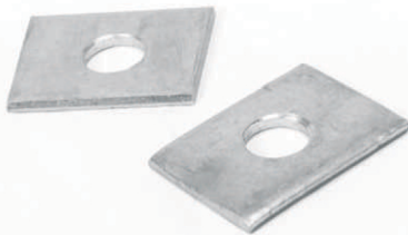
S.S SQ. WASHER