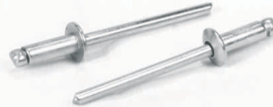
S.S POP/BLIND RIVET