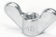
S.S WING NUT