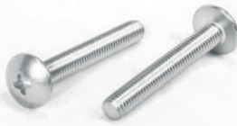
S.S PH. TRUSS HEAD