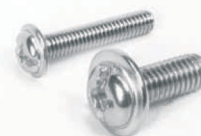
S.S WAFER SCREW