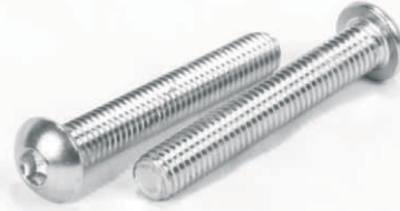
S.S BUTTON HEAD