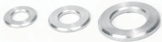
S.S MACHINE WASHER