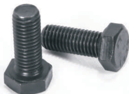
HIGH TENSILE HEX BOLT