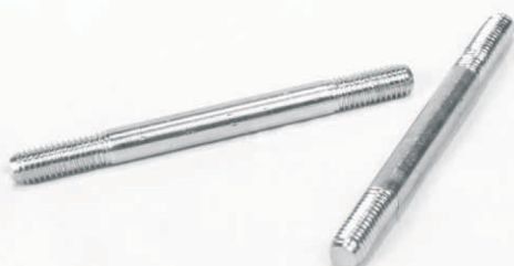
S.S HALF THREAD STUD