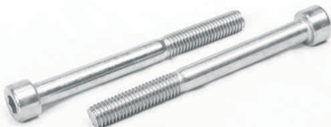
S.S HALF THREAD ALLEN CAP BOLT