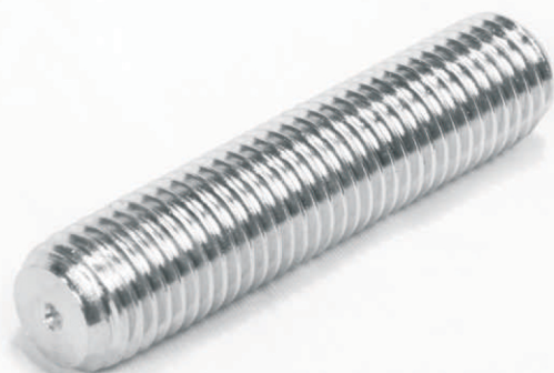
S.S FULL THREAD STUD