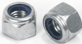
S.S NYLOCK NUT