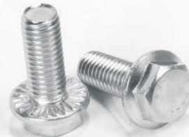
S.S FLANGE BOLT