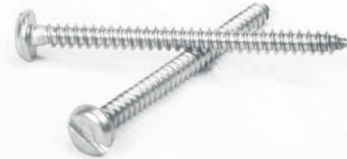
S.S SLOTTED PAN HD. SELF-TAPPING SCREW