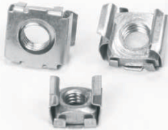
S.S CAGE NUT