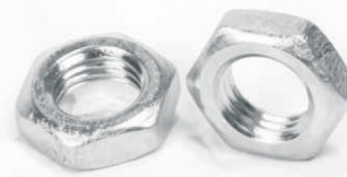
S.S LOCK NUT / THIN NUT