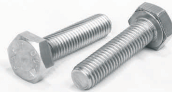
S.S HEX BOLT / HEX SCREW