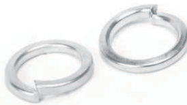
S.S SP. SQ. WASHER