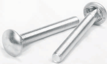
S.S CARRIAGE BOLT