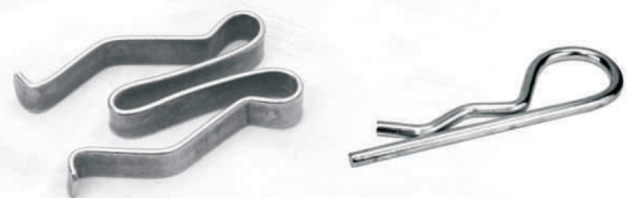
S.S W-PIN & S.S R-PIN