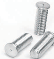
S.S WELD STUD