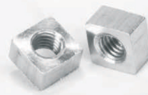
S.S SQUARE NUT