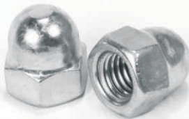
S.S DOME NUT