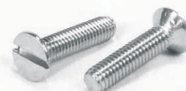
S.S SLOTTED CSK HD. SCREW