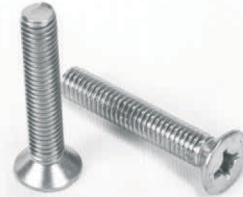
S.S PH. CSK SCREW