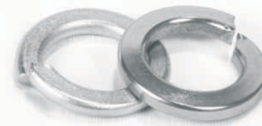
S.S SP. FLAT WASHER