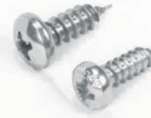
S.S PH. PAN HEAD SELF-TAPPING SCREW