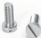
S.S SLOTTED CH. H.D SCREW