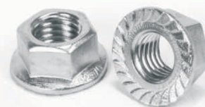
S.S FLANGE NUT