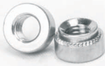
S.S CLINCH NUT