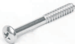
S.S B-TYPE SELF-TAPPING SCREW