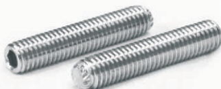
S.S ALLEN GRUB SCREW