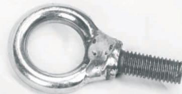
S.S I-BOLTS LIFTING HOOK