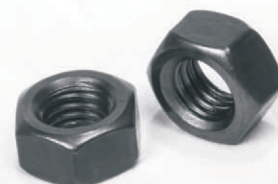
HIGH TENSILE HEX NUT