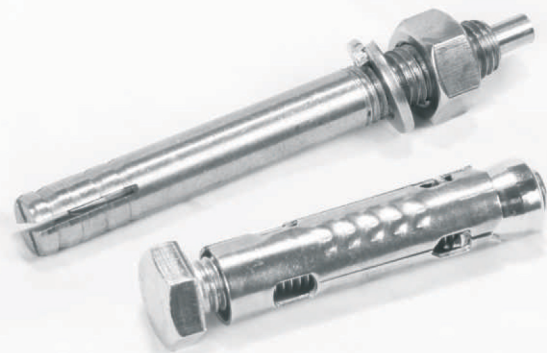
S.S ANCHOR BOLT