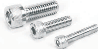
S.S ALLEN CAP BOLT