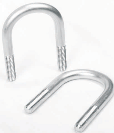
S.S U - BOLT