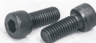
HIGH TENSILE ALLEN CAP BOLT